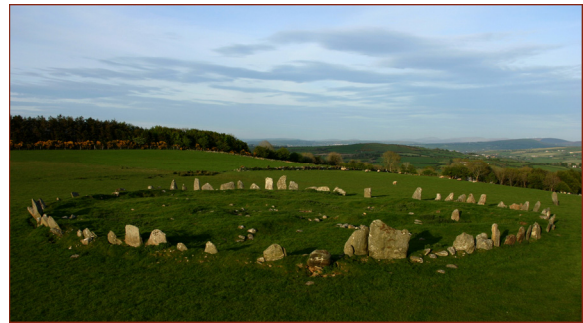
Beltany Stone Circle from the West