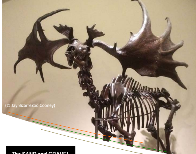
(© Jay BizarreZoo Cooney)

The SAND and GRAVEL deposits left behind by glaciers sustains Irelands construction industries